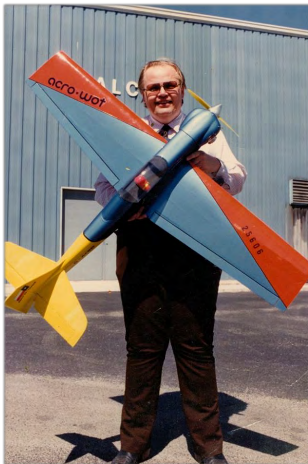
Me and my Acro Wot, freshly built. This shows the relative size, similar to the Kougat.

Old Warden is a grass strip aerodrome north of London between the M1 and the M11. It is the home of the Shuttleworth Collection, which comprises airplanes from the dawn of aviation to the start of WW II. On modeling days, they run the gamut. Radio control flies off the main runway closest to the museum and hangars. Farther off they have control line and free flight areas, all going all the time. A, then, small attendance fee gave you access to the museum collection and all the aviation activities. If you are planning a trip to the UK, I highly recommend a trip to see the Shuttleworth Collection. A quick glance at their website shows they are still doing several model aviation days a year.