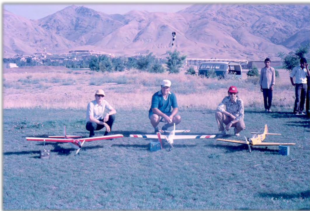
R/C in Tehran, Iran, early 1970s